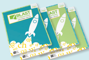
Student Workbooks 20 sets