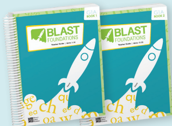
Teacher Guides 1 set